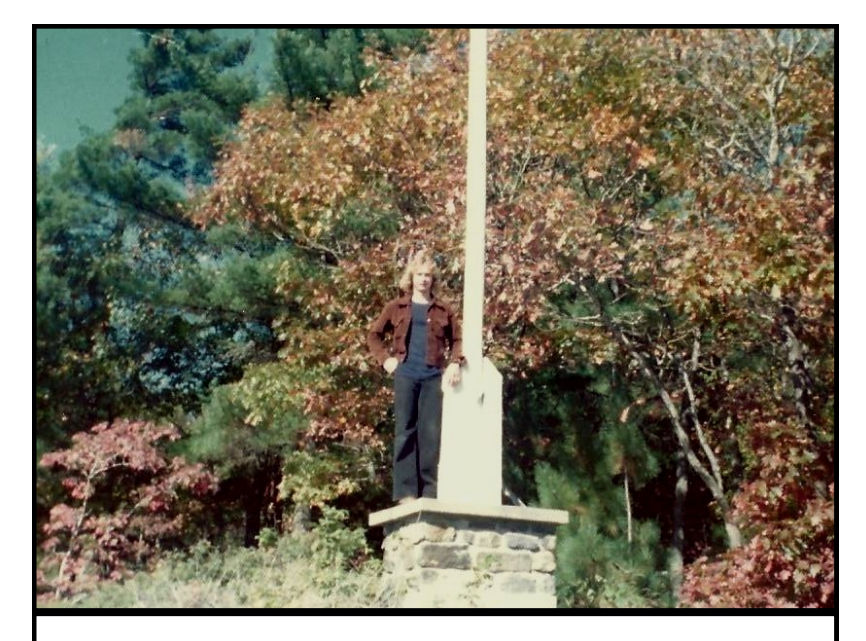
10. Jeff Taylor standing at the flag pole base after raising the flag.