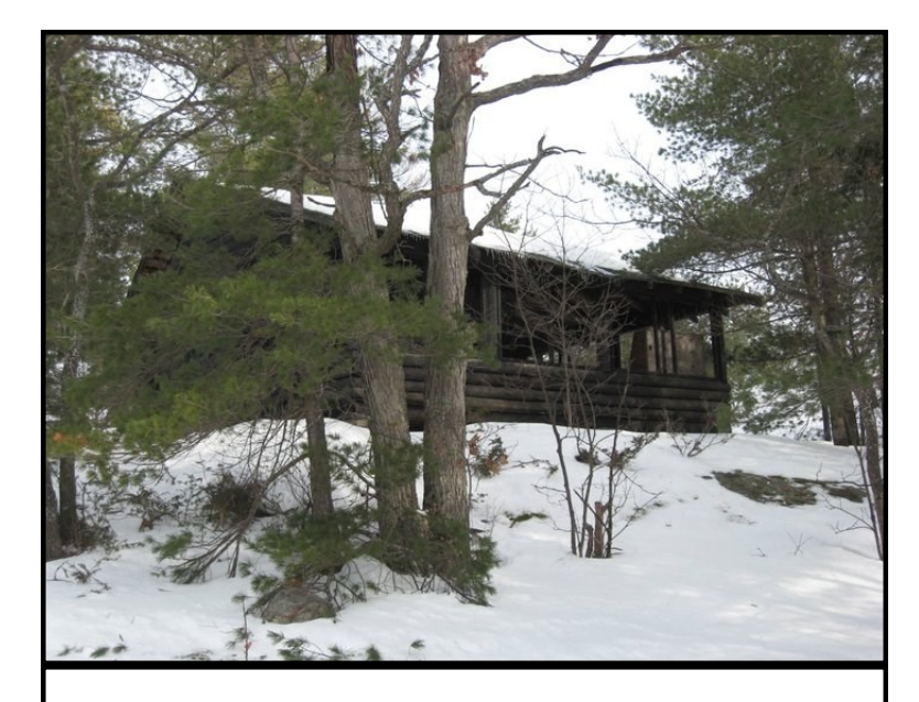
4. Taylor family's first winter visit to the lodge. Guest Cabin.