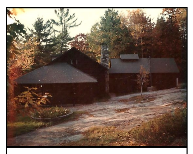
9. East Side of Lodge and Kitchen. Photo taken from Guest Cabin.